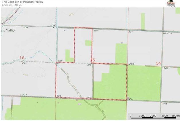
The Corn Bin at Pleasant Valley Arkansas, AC +/-

Bill Moore P: (318) 617-7106 | bmoore@mossyoakproperties.com | 1945 East 70th Street, Ste A, Droweport, LA 71105